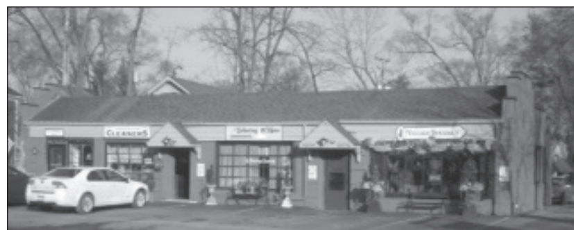
“Village Plaza” or Jones Building, after