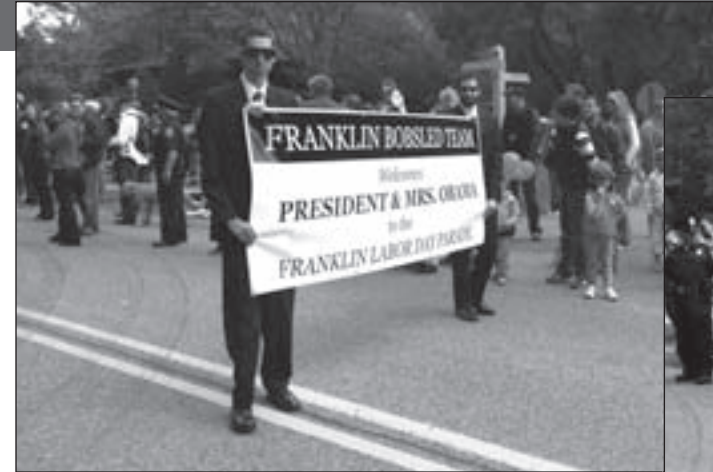
Labor Day Round Up 2011 was a huge success this year, and parade-goers were surprised by an unannounced visit from President and Mrs. Barack Obama*, sponsored by the Franklin Bobsled Team.