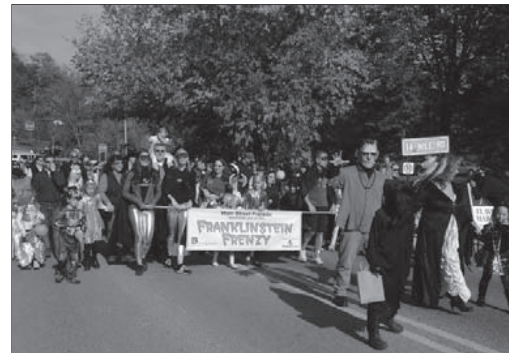
The 2nd Annual Franklins Frenzy 2011 was a monstrous success this year! Franklinites of all ages dressed in costume and took to terrorizing the streets in parade form. Residents enjoyed trick-or-treating, a haunted room at Gorback Fine Photography, apple bobbing, face painting, Looney Bin coffin races and a bonfire. More photos on page 3.