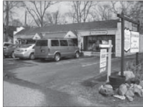
“Village Plaza” or Jones Building, before

MSF is pleased to be a part of the wonderful things that are creating value in the historic Village Center and to our residents at large, from the Farmers Market, DIA Inside|Out program and Franklinstein, to the beautification of our historic buildings. Look for more exciting things to come!