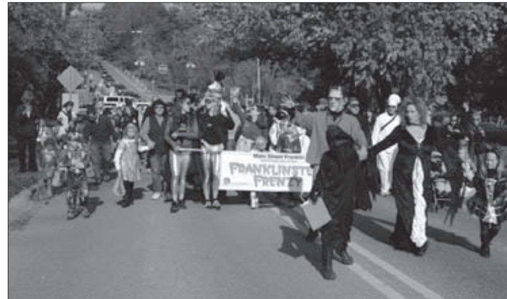
Princesses, ghosts, goblins, chefs, robots, reapers and shiny tights galore! Franklin residents of all ages turned out in fine form for this year's Franklins Frenzy.