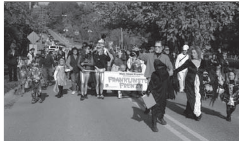
Princesses, ghosts, goblins, chefs, robots, reapers and shiny tights galore! Franklin residents of all ages turned out in fine form for this year's Franklins Frenzy.