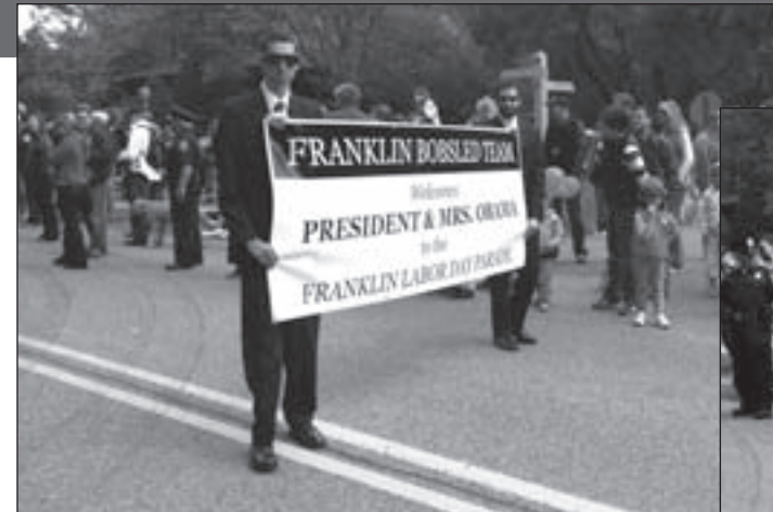
Labor Day Round Up 2011 was a huge success this year, and parade-goers were surprised by an unannounced visit from President and Mrs. Barack Obama*, sponsored by the Franklin Bobsled Team.