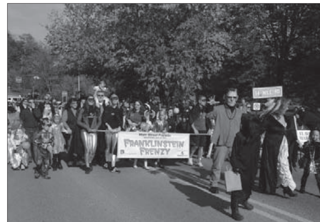
The 2nd Annual Frankenstein Frenzy 2011 was a monstrous success this year! Franklinites of all ages dressed in costume and took to terrorizing the streets in parade form. Residents enjoyed trick-or-treating, a haunted room at Gorback Fine Photography, apple bobbing, face painting, Looney Bin coffin races and a bonfire. More photos on page 3.