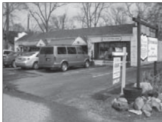
“Village Plaza” or Jones Building, before

MSF is pleased to be a part of the wonderful things that are creating value in the historic Village Center and to our residents at large, from the Farmers Market, DIA Inside|Out program and Franklinstein, to the beautification of our historic buildings. Look for more exciting things to come!