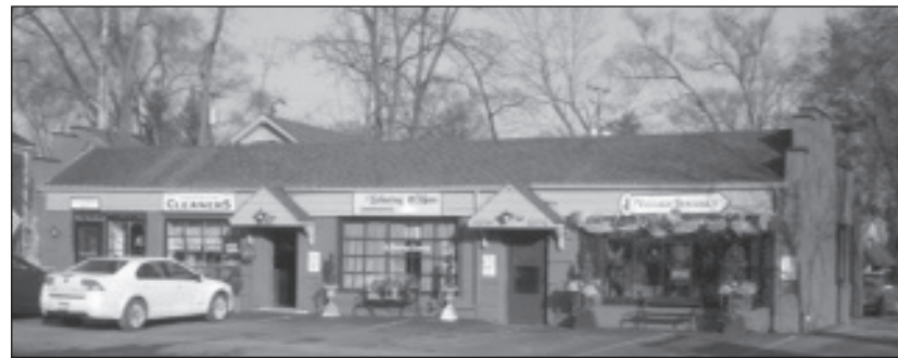
“Village Plaza” or Jones Building, after